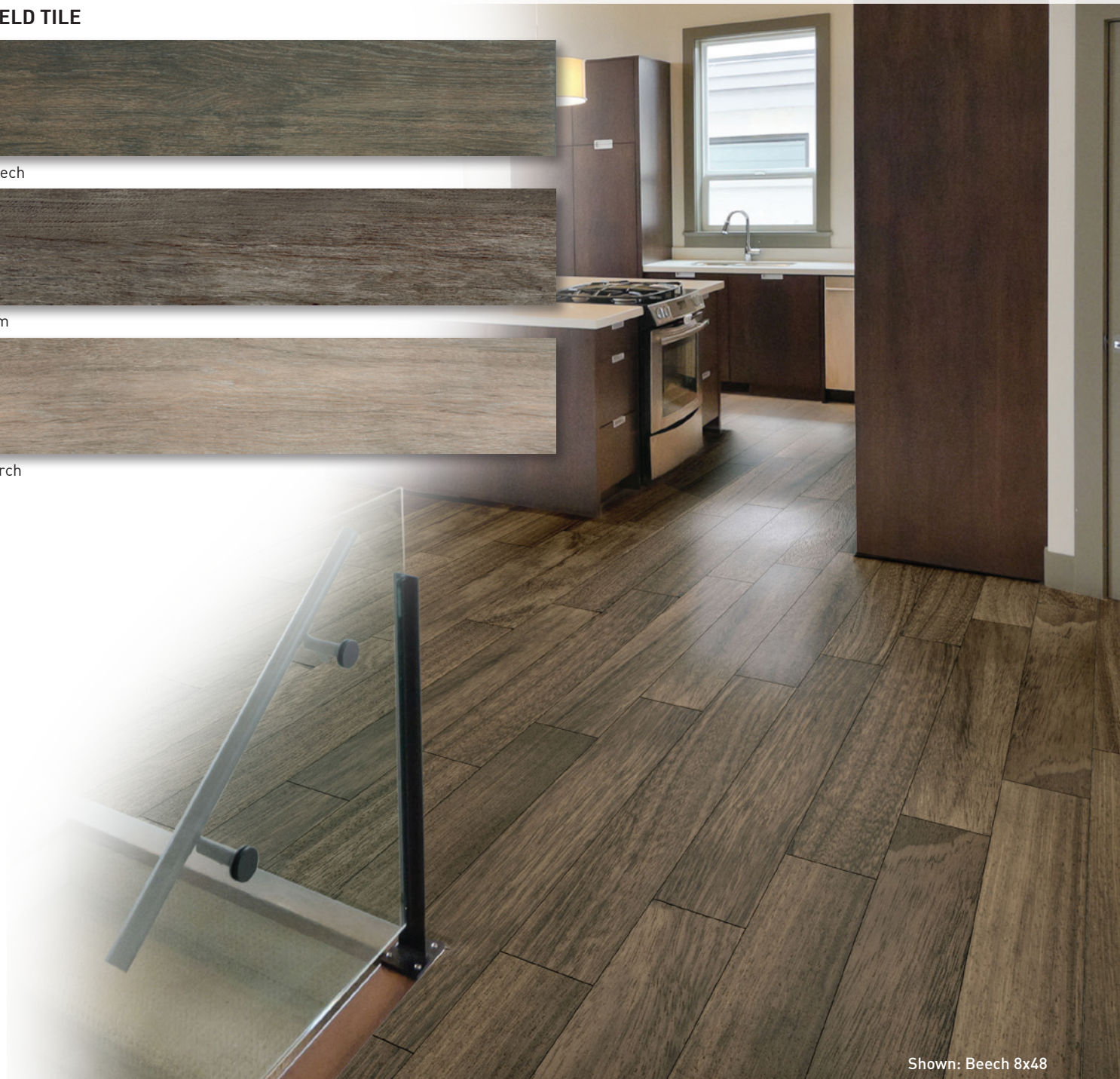
Shown: Beech 8x48