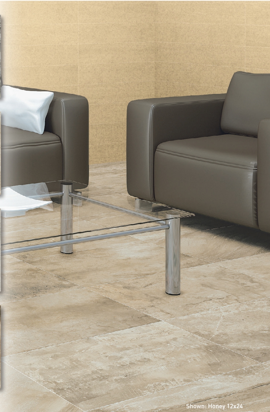
Shown: Honey 12x24