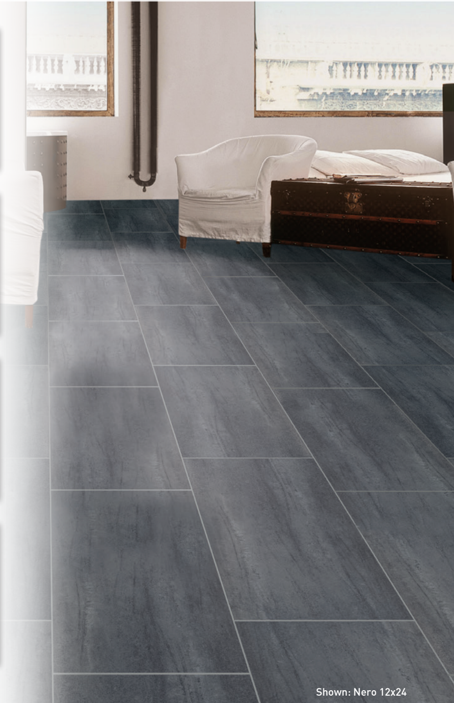
Shown: Nero 12x24