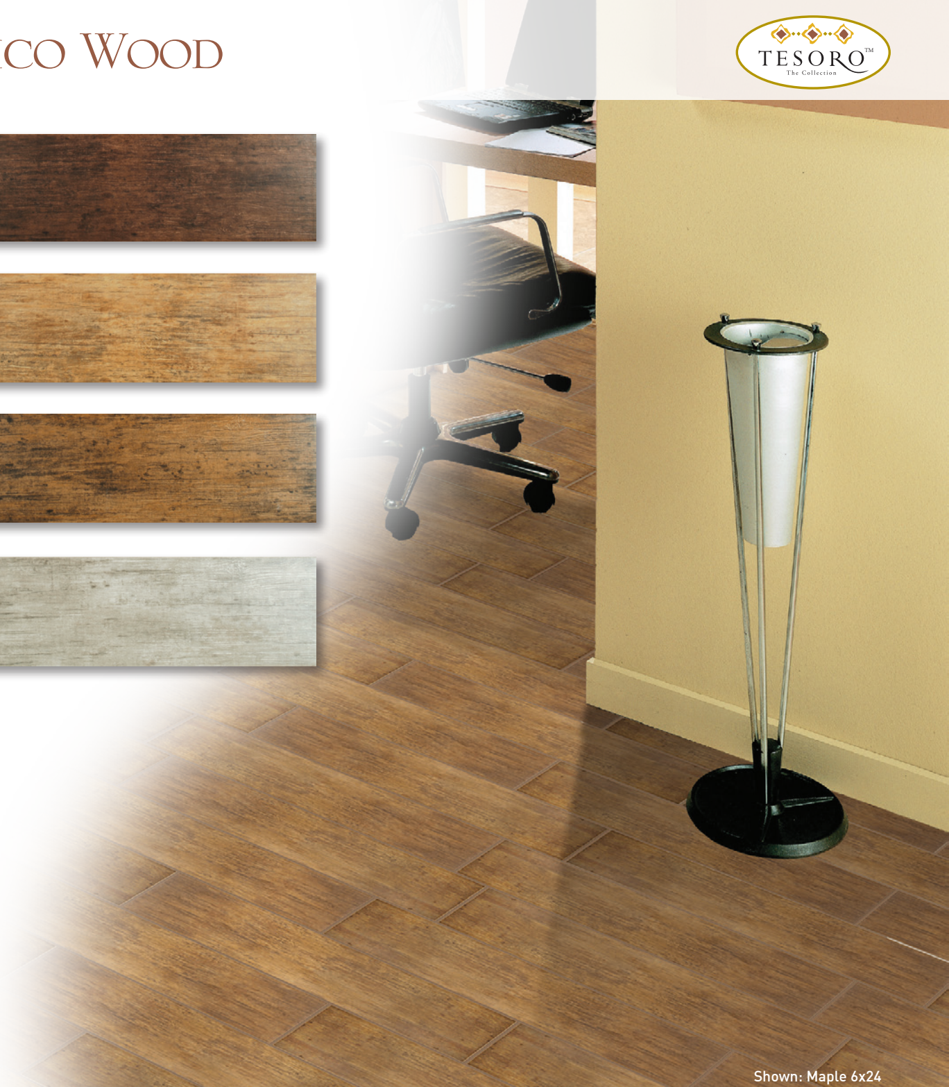
Shown: Maple 6x24